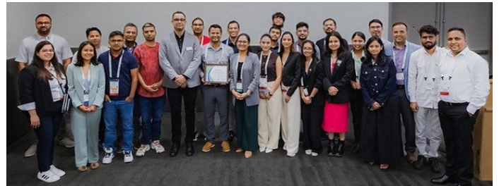
Top left: Bangladesh Association for Food Protection in North America