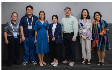
Members of the Southeast Asia Association for Food Protection met on July 28 during IAFP 2025.

Current challenges for the Affiliate were discussed, including scheduling meetings for members living in different time zones around the world and obtaining sponsorship for the ACAFP Food Safety Conference in Africa.