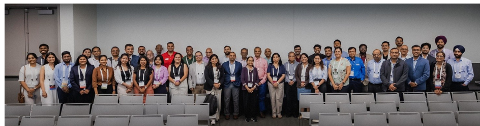
The Indian Association for Food Protection in North America held its Annual Meeting on July 29 during IAFP 2025.