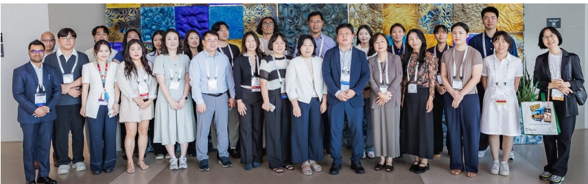
Below: China Association for Food Protection/Chinese Association for Food Protection in North America