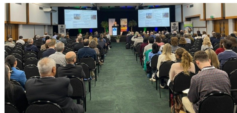
Participants are shown at a plenary session during the joint NZIFST and NZFSSRC Annual Conference held June 25–28.

long-standing service as Delegate. NZAFP will continue its mid-year video catch-up, which has proven valuable in maintaining momentum between meetings.