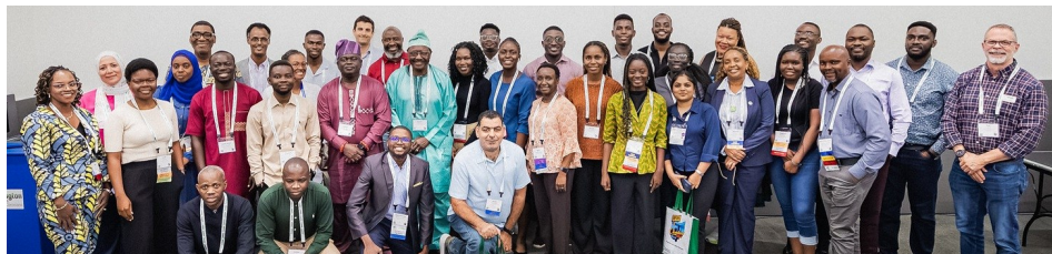
The African Continental Association for Food Protection held its Annual Meeting on July 29 during IAFP 2025.